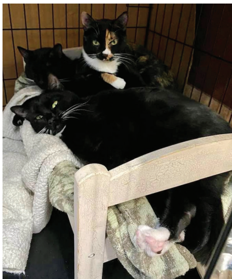
Home is where the cat is

TheCatadvocates.com TheCatAdvocates@gmail.com 863 Knight Rd. Comox, BC V9M 3T3